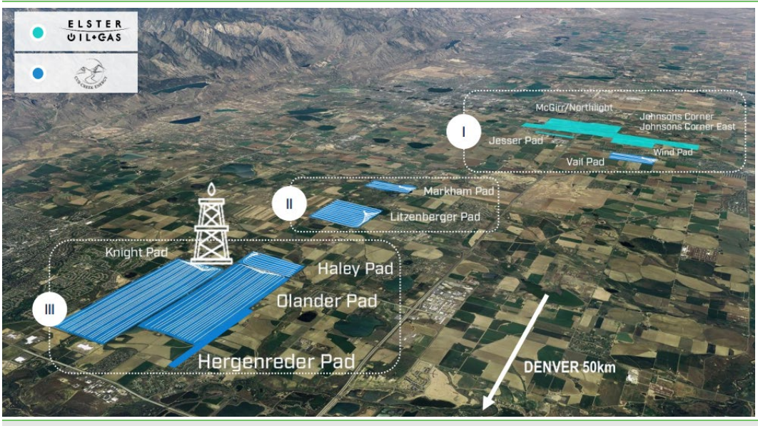
Exhibit 2: Location of Knight and Olander pads, Colorado

In its most extensive drilling programme to date, Cub Creek drilled 12 wells from the Knight pad, which sits immediately to the west of Olander, between February and May 2021. Each well has a horizontal section of 2.25 miles and the campaign cost c $60m of which Cub Creek pays c 90%. The wells are currently being completed and are expected to come onstream in Q421.